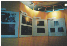
Installation of the BIB'81