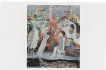
Dušan Kállay /Slovakia - Grand Prix BIB'83