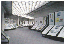
Installation of the BIB'93