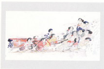
Jasuo Segawa /Japan - Grand Prix BIB'67