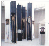
Exhibition of Stays Eldrigevicius Grand Prix BIB'91