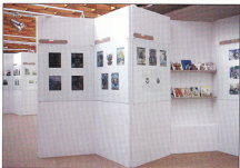
Installation of the BIB'85