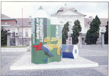
Exterior promotion of the BIB'85