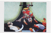
Lorenzo Mattotti /Italy - Grand Prix BIB'93